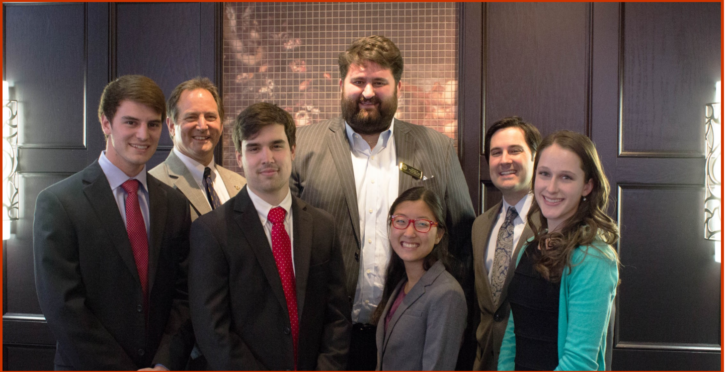
TAPL Scholarship recipients